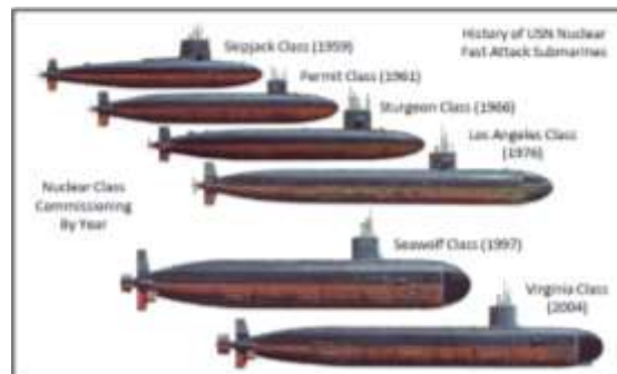
Illustration of hull shapes for US Navy nuclear attack submarines